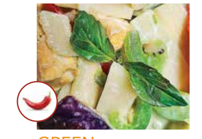
Choice of Protein, Peas, Carrots, Bell peppers, Egg Plant and Bamboo Shoots in Coconut Milk and Green Curry Paste Chicken, Pork or Tofu $13.99 Beef $15.99 Shrimp $16.99 Seafood $21.99