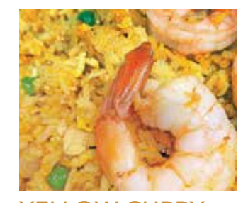
YELLOW CURRY Stir-fried Rice with choice of Protein, Peas, Carrots, Onions and Yellow Curry Powder Chicken, Pork or Tofu $12.99 Beef $14.99 Shrimp (6) $14.99 Combination $16.99