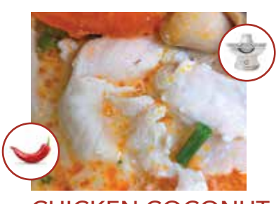
CHICKEN COCONUT Chicken with Straw Mushrooms, Tomatoes, Lemon Grass, Lime Juice, Coconut Milk, and Mixed Spices $17.99