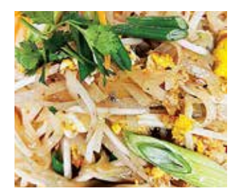
FRIED NOODLE W/CRAB

Stir-fried Rice Noodles with Crab, Egg and Vegetables $15.99