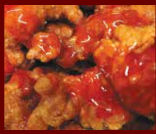
ORANGE CHICKEN $10.99