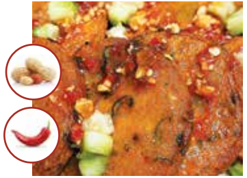
THAI FISH CAKES Deep-fried Fish Cakes served with a Vinegar Sweet & Sour Chili Sauce and Crushed Peanuts $12.99