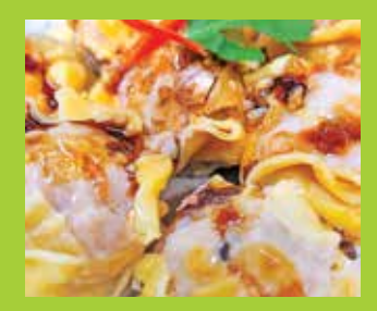
SHU MAI DUMPLINGS

Choice of Protein sautéed with Onions, Cilantro, Chili Sauce, and Vegetables Chicken, Pork or Tofu $14.99 Beef $15.99