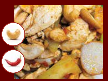
CASHEW CHICKEN $11.99