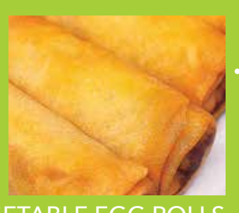
VEGETABLE EGG ROLLS

Served with a Sweet & Sour Sauce 8 rolls $9.99 4 rolls $6.99 1 roll $2.00