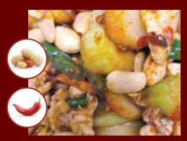
KUNG PAO CHICKEN $11.99