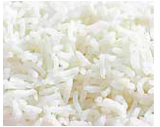
STEAMED RICE Medium $2.99 Large $3.99