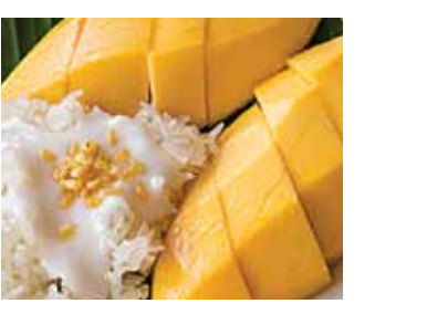
STICKY RICE W/MANGO (While in Season) $10.99